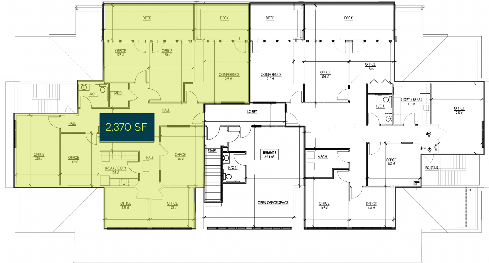
BUILDING 2 2ND FLOOR | 2,370 SF