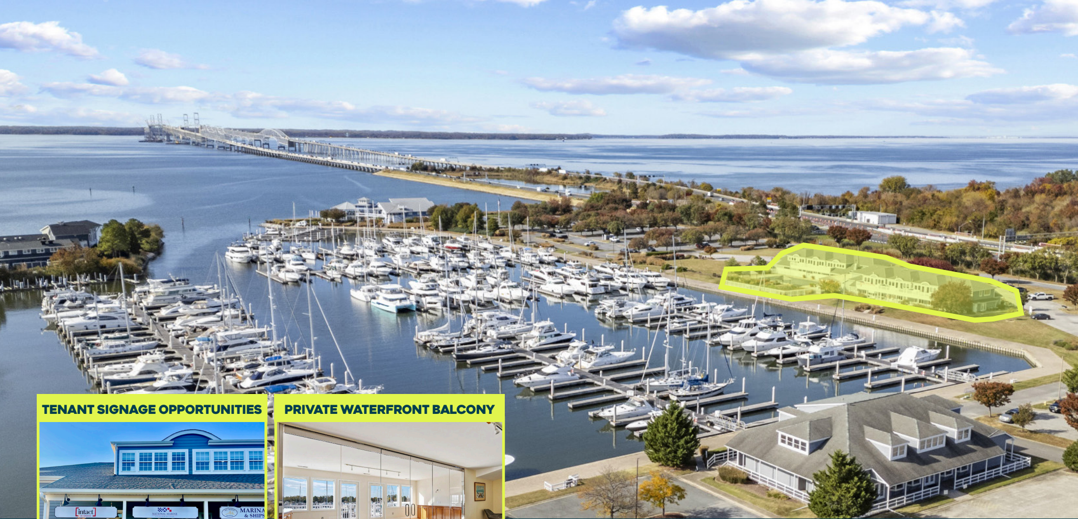
TENANT SIGNAGE OPPORTUNITIES