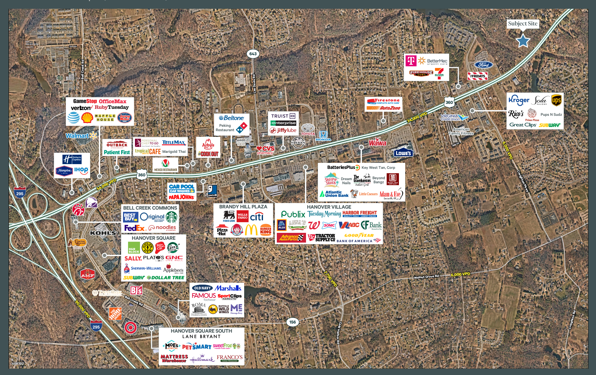
© 2024 CBRE, Inc. All rights reserved. This information has been obtained from sources believed reliable, but has not been verified for accuracy or completeness. You should conduct a careful, independent investigation of the property and verify all information. Any reliance on this information is solely at your own risk. CBRE and the CBRE logo are service marks of CBRE, Inc. All other marks displayed on this document are the property of their respective owners, and the use of such logos does not imply any affiliation with or endorsement of CBRE. Photos herein are the property of their respective owners. Use of these images without the express written consent of the owner is prohibited.

6200 Mechanicsville Turnpike, Mechanicsville, VA 23111