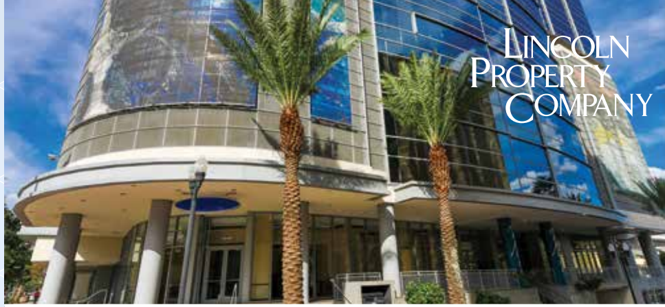
View From Amenity Level