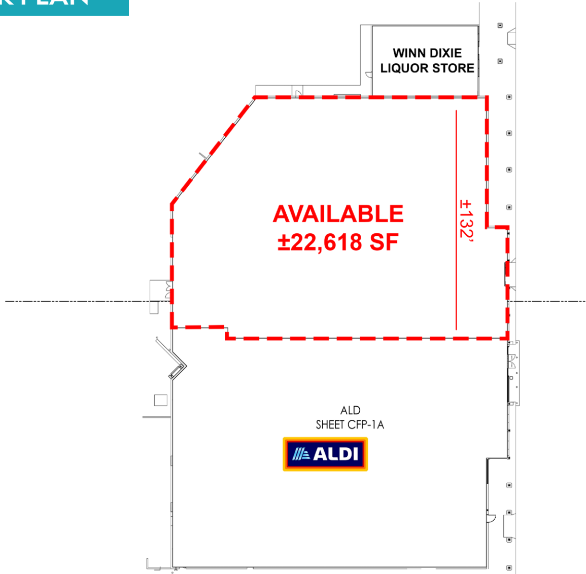
1 Proposed Plan Overview SCALE: 1/16" = 1'-0"

ELIZABETH WRIGHT 561.699.2790 ewright@marketlinkcre.com