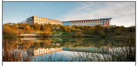
REPUTATION FOR QUALITY