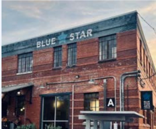
BLUESTAR ARTS COMPLEX