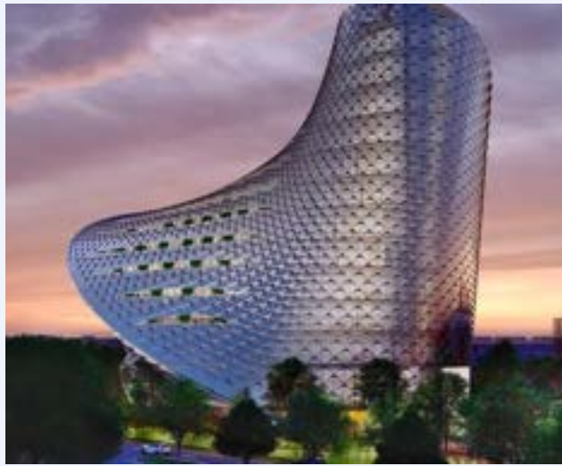
TECH PORT CENTER & ARENA