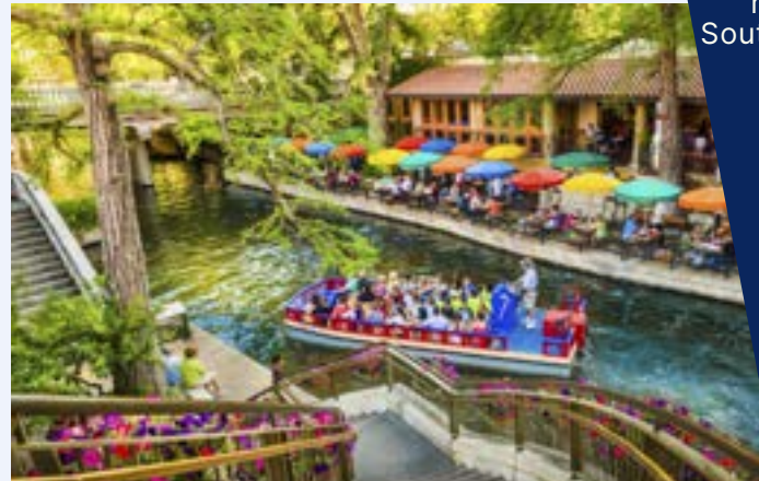
THE SAN ANTONIO RIVER WALK