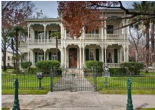
KING WILLIAM HISTORIC DISTRICT