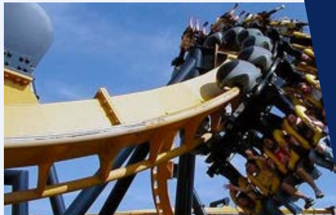
SIX FLAGS OVER TEXAS FIESTA TEXAS