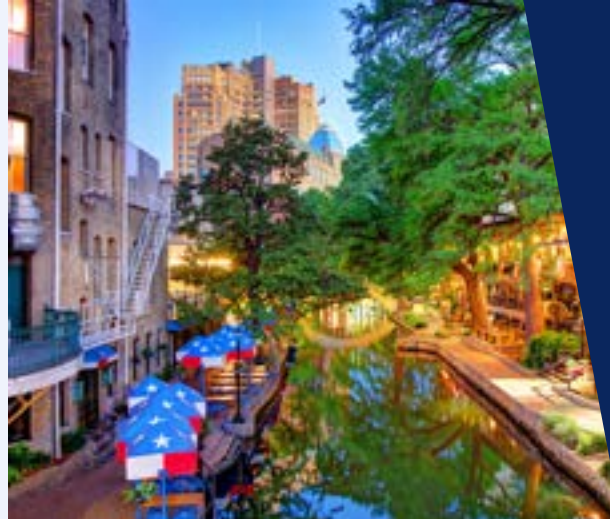
SAN ANTONIO RIVERWALK