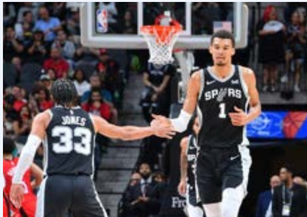
SAN ANTONIO SPURS