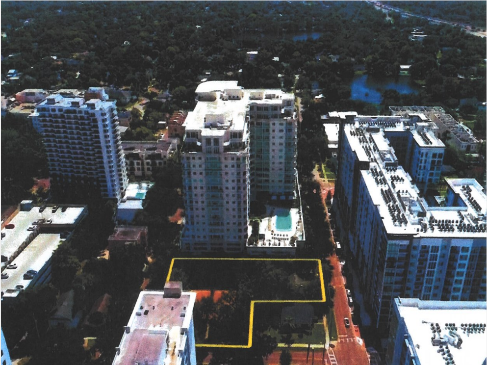
Aerial Site Outline