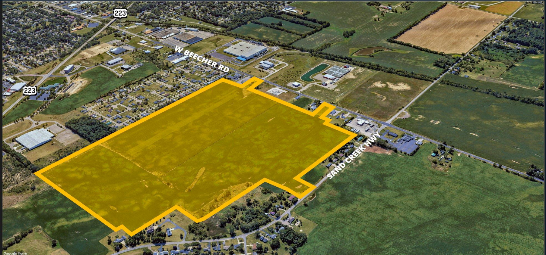
155-Acre contiguous parcel outlined · Bordered by W. Beecher Rd., Sand Creek Hwy, and Route 223

W. Beecher Rd. & Sand Creek Hwy · Adrian, MI