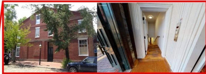
Second Entrance from Federal Street showing steps & elevator down to the Lower Level Retail.