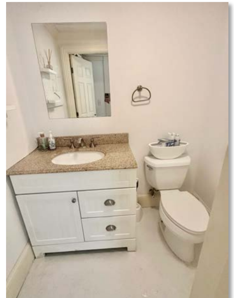
Lower-Level Retail Bathroom

For Additional Information Please Contact: