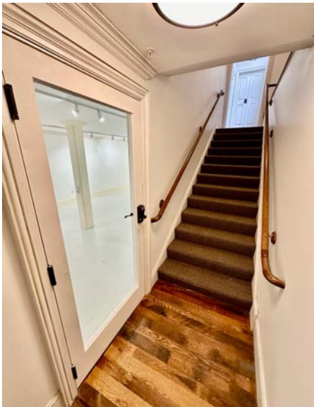
Lower-Level Retail Entrance