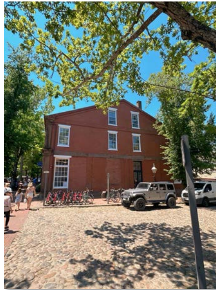
External View from Federal Street