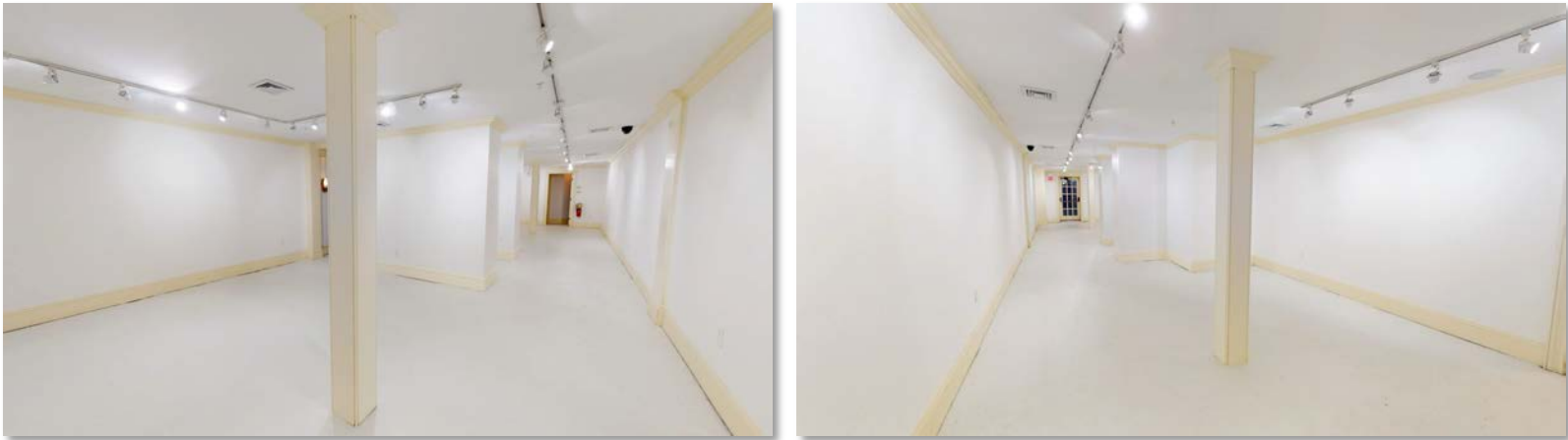
Lower Level Current Condition

Visit www.33ACK.com for more information and videos.