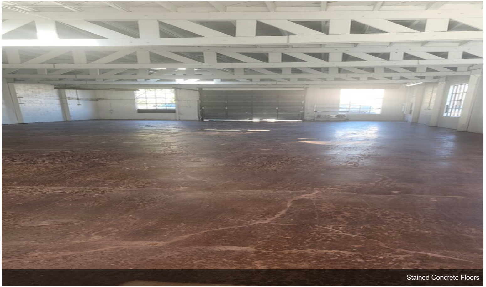
Stained Concrete Floors