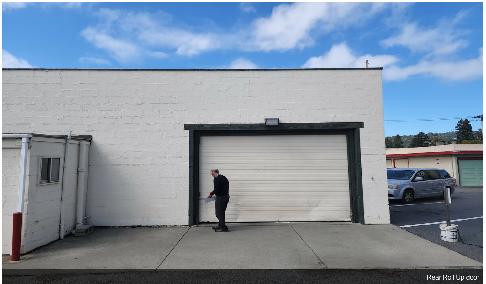
Rear Roll Up door