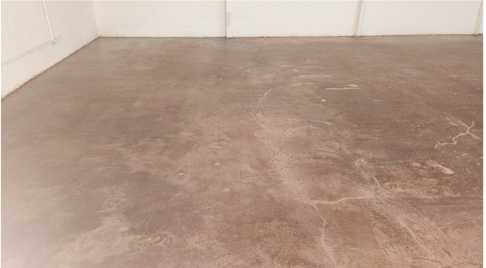
Stained Concrete Floors