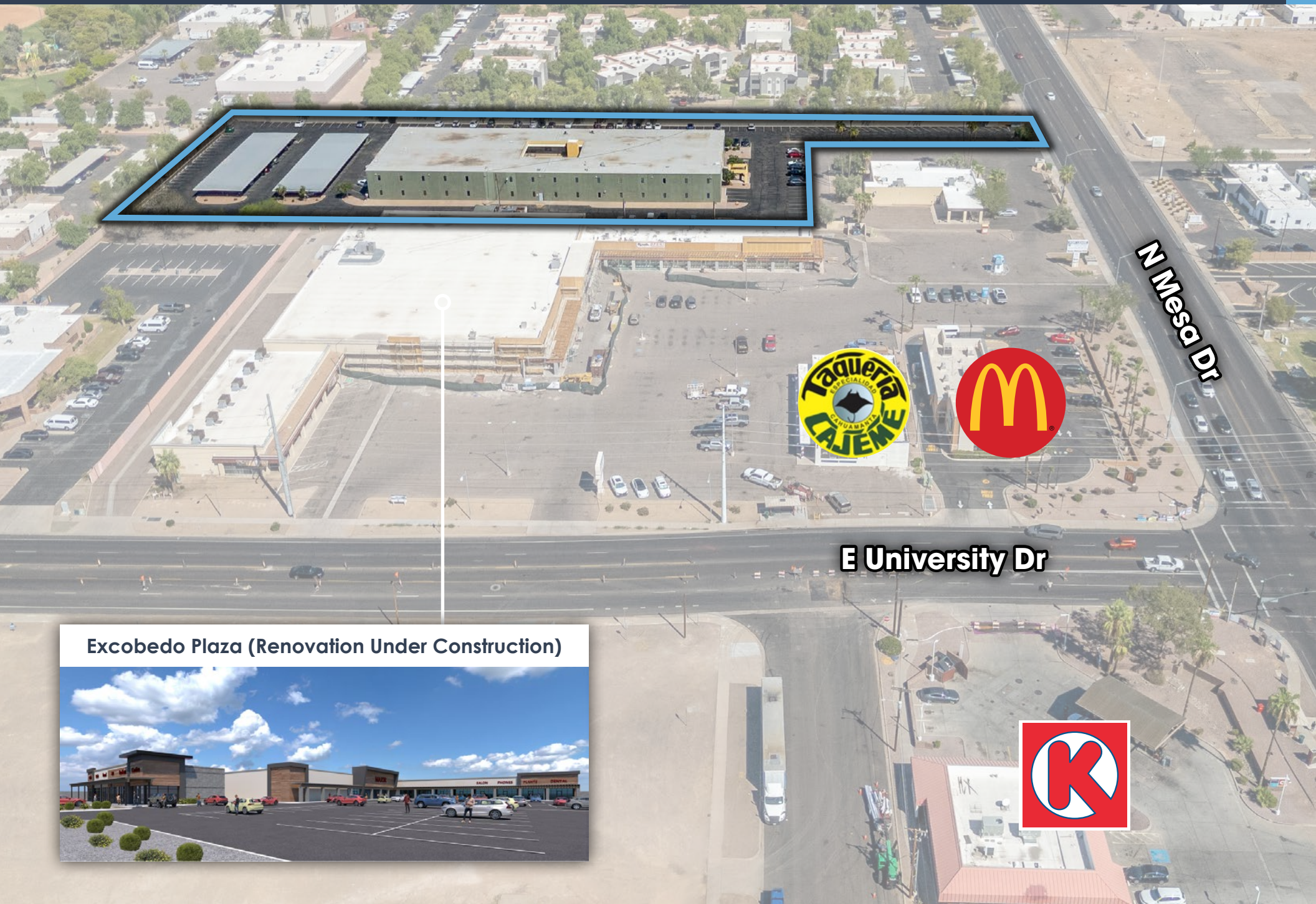
Excobedo Plaza (Renovation Under Construction)