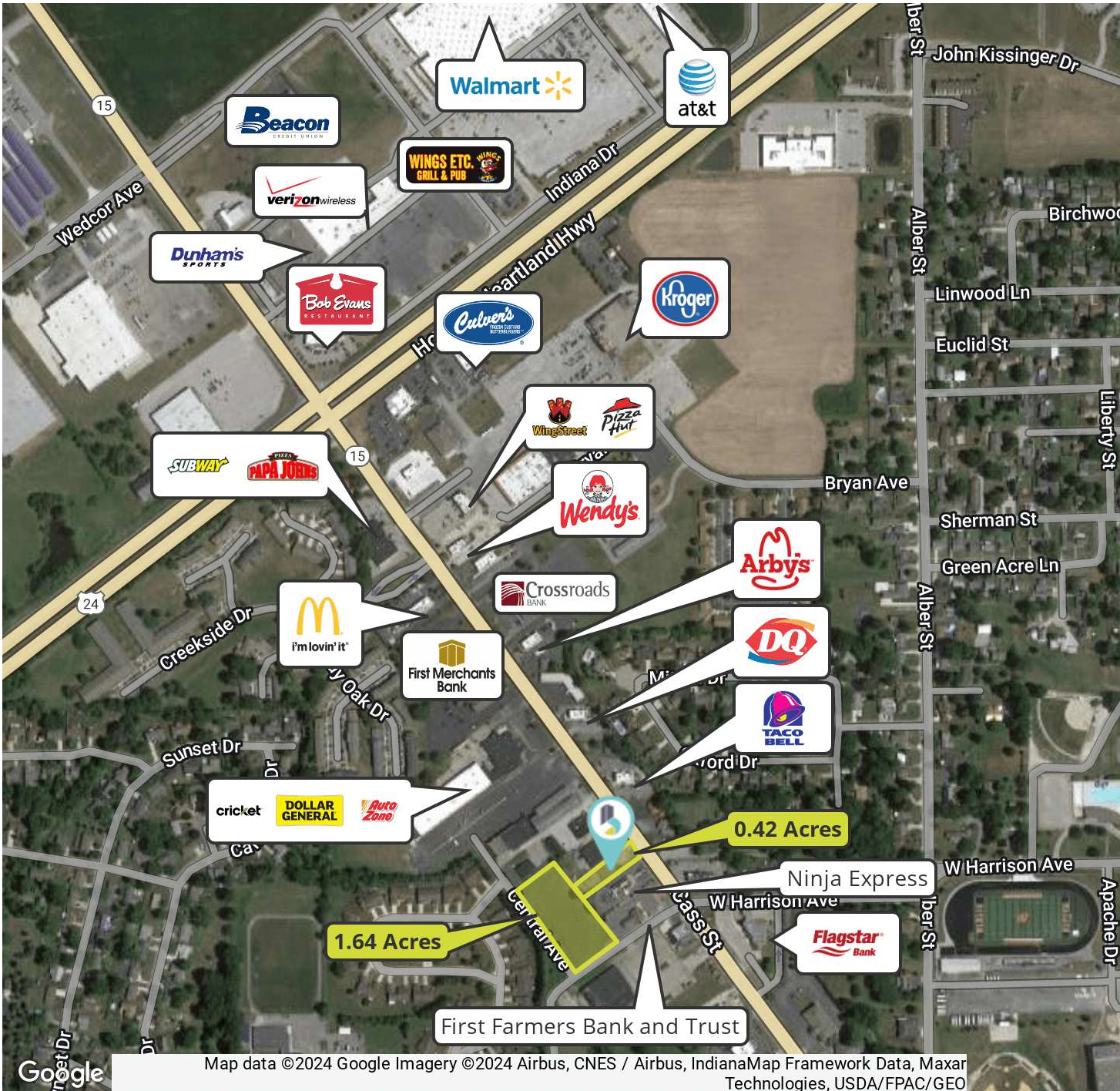
Map data ©2024 Google Imagery ©2024 Airbus, CNES / Airbus, IndianaMap Framework Data, Maxar Technologies, USDA/FPAC/Geo

CHAD VOGLEWEDE Broker 260.639.3377 cvoglewede@bradleyco.com