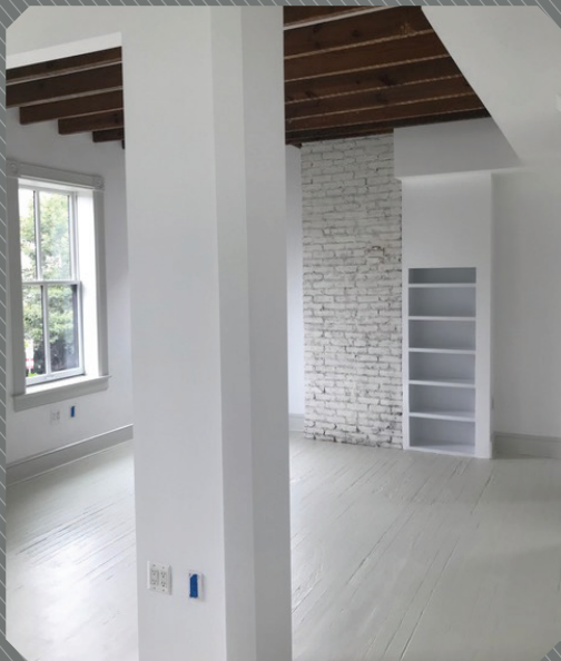
PART OF GREAT ROOM