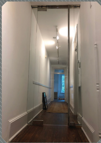
SHARED KITCHEN PRIVATE INNER HALLWAY