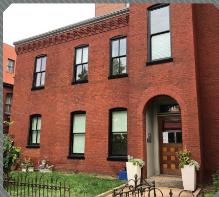
SHARED KITCHEN EXTERIOR