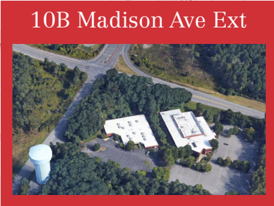
10B Madison Ave Ext