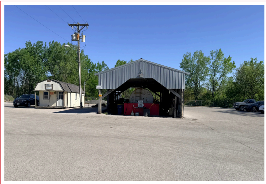
Covered outdoor storage