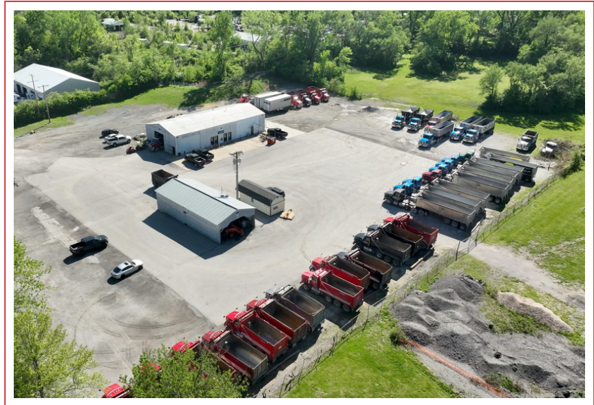
Gated parking and yard space