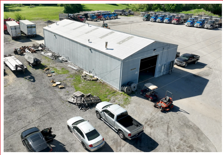
3,600 SF building with drive-thru capability