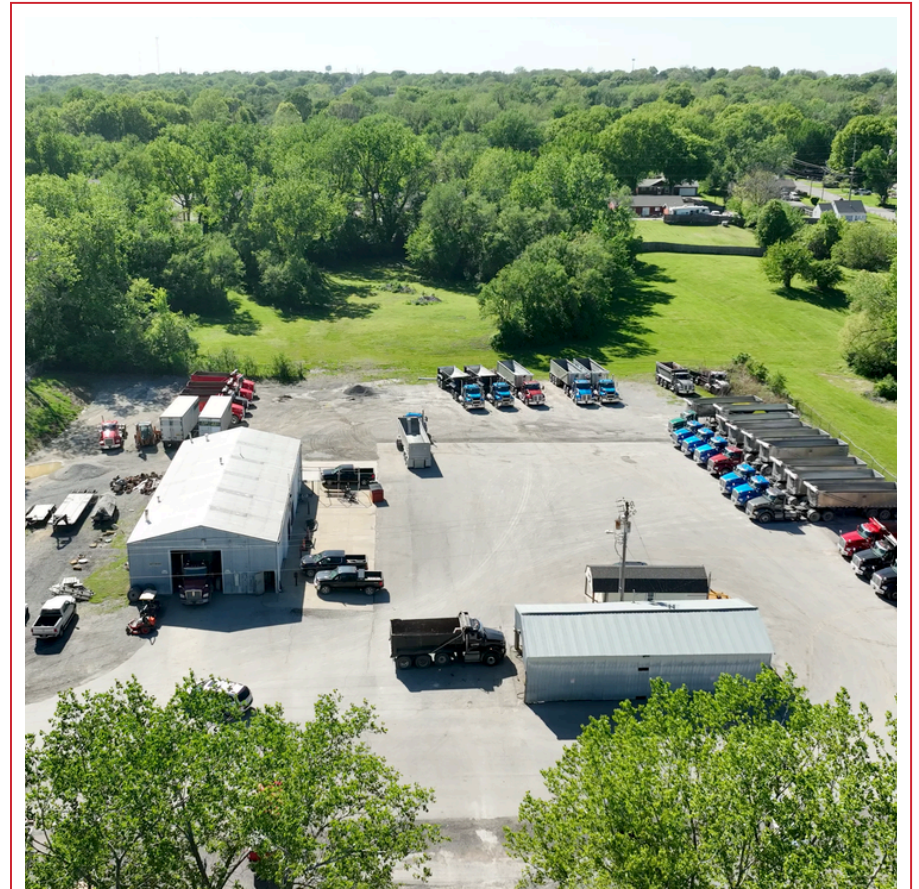
Property View Facing West