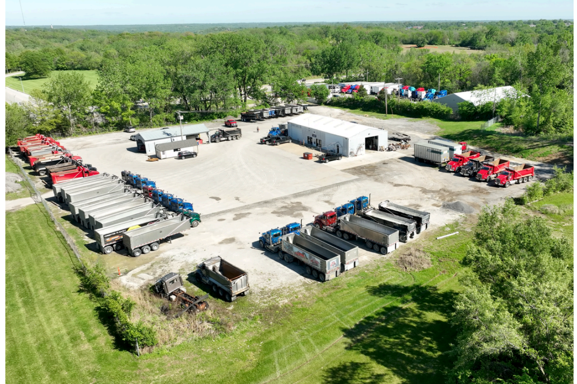
Property View Facing Southeast