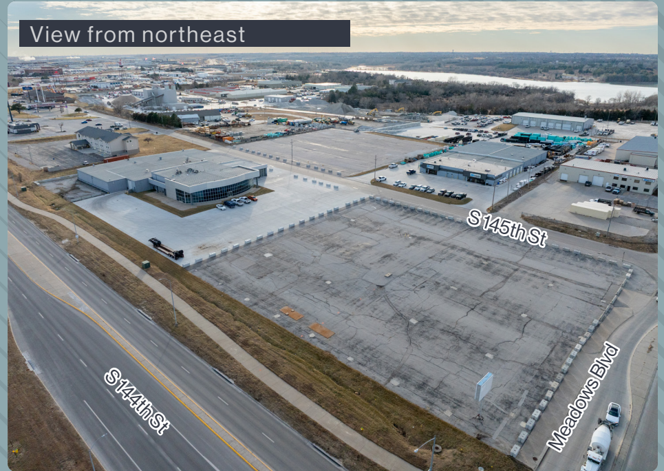
View from northeast