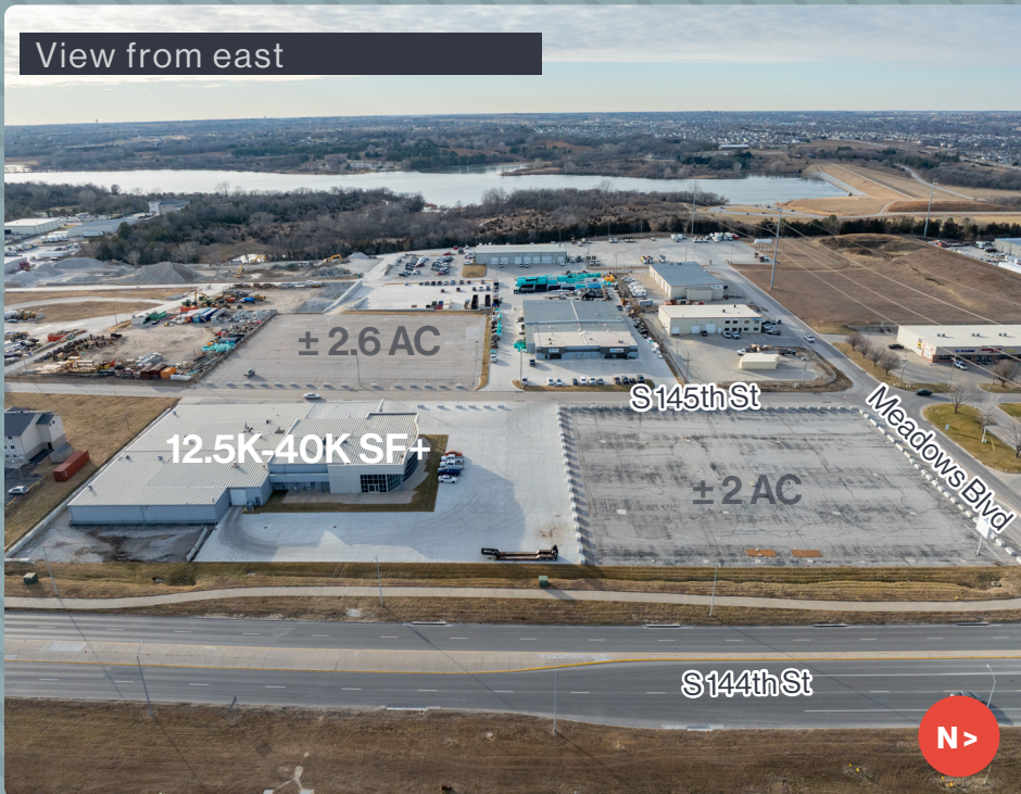
View from east