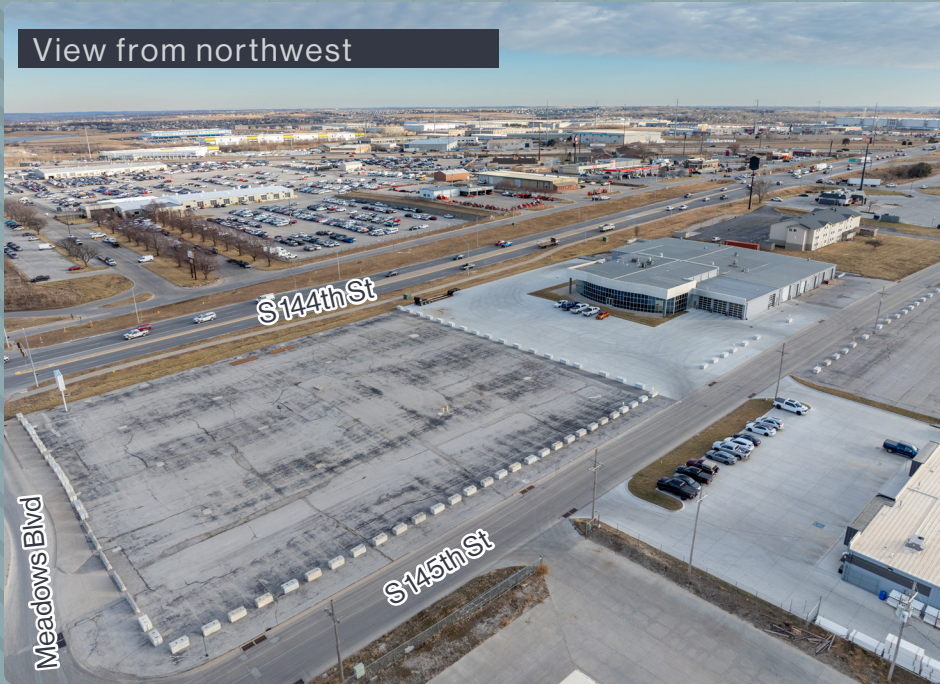
View from northwest