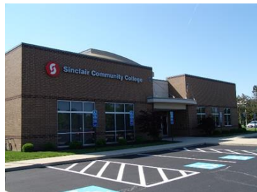
Community College, Mason, OH