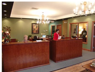
Surgery Center, Centerville, OH