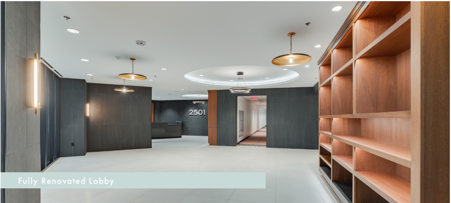
Fully Renovated Lobby