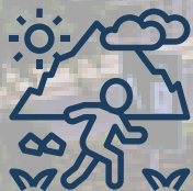
Parks & Recreation