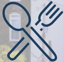
Retail & Dining