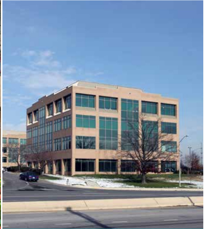
3915 NATIONAL DRIVE