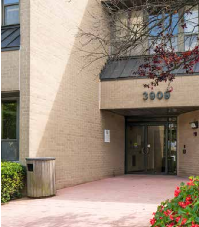
3909 NATIONAL DRIVE