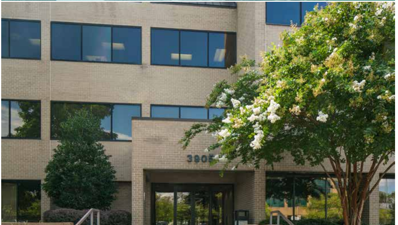
3905 NATIONAL DRIVE