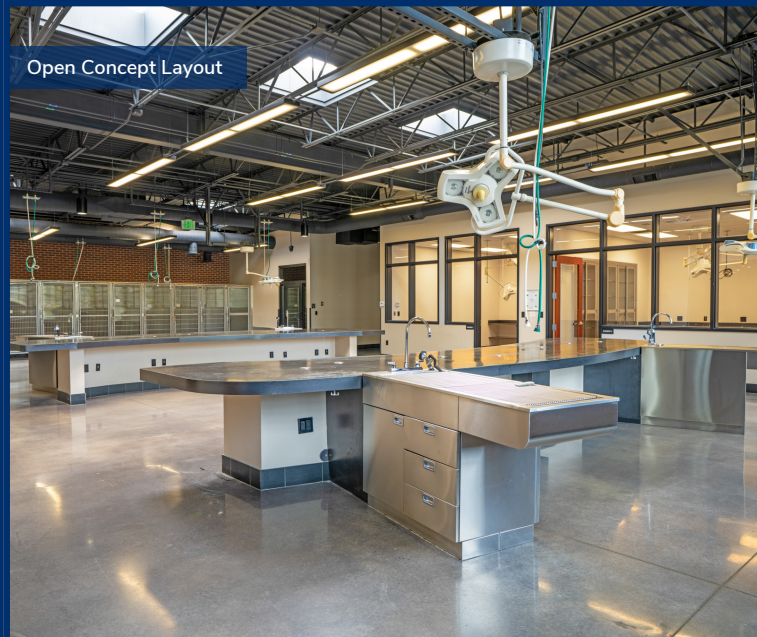
Open Concept Layout