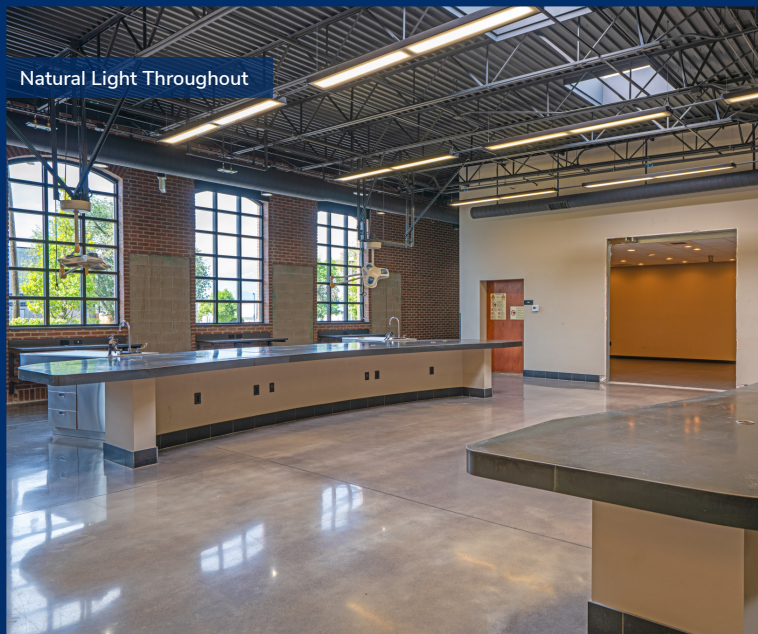
Natural Light Throughout