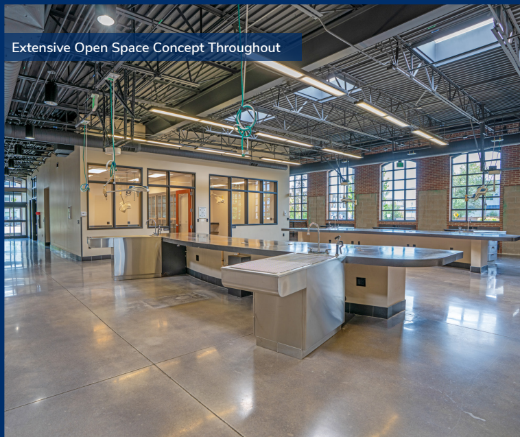
Extensive Open Space Concept Throughout