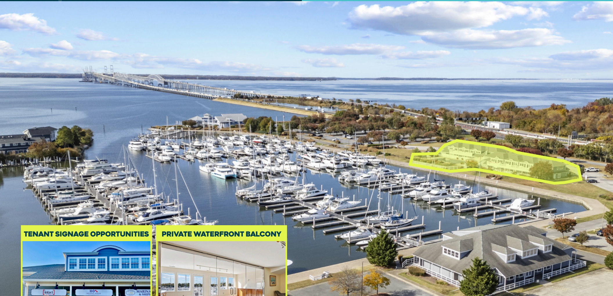
TENANT SIGNAGE OPPORTUNITIES

LUXURY, WATERFRONT OFFICE SPACE FOR LEASE Unique + Vibrant Waterfront Location