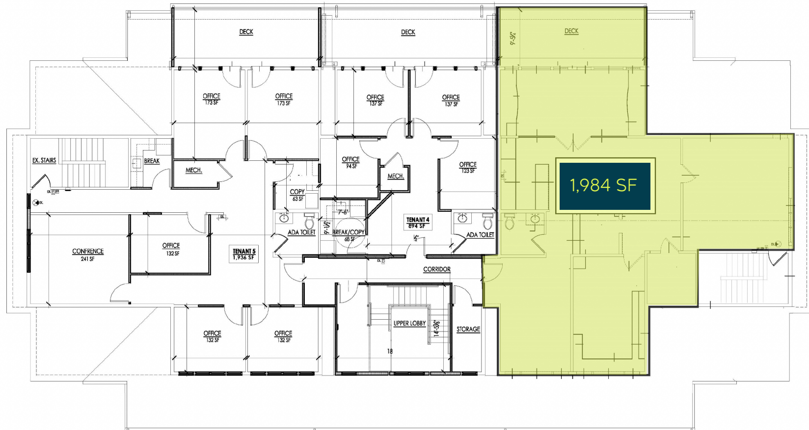
BUILDING 3 2ND FLOOR | 1,984 SF