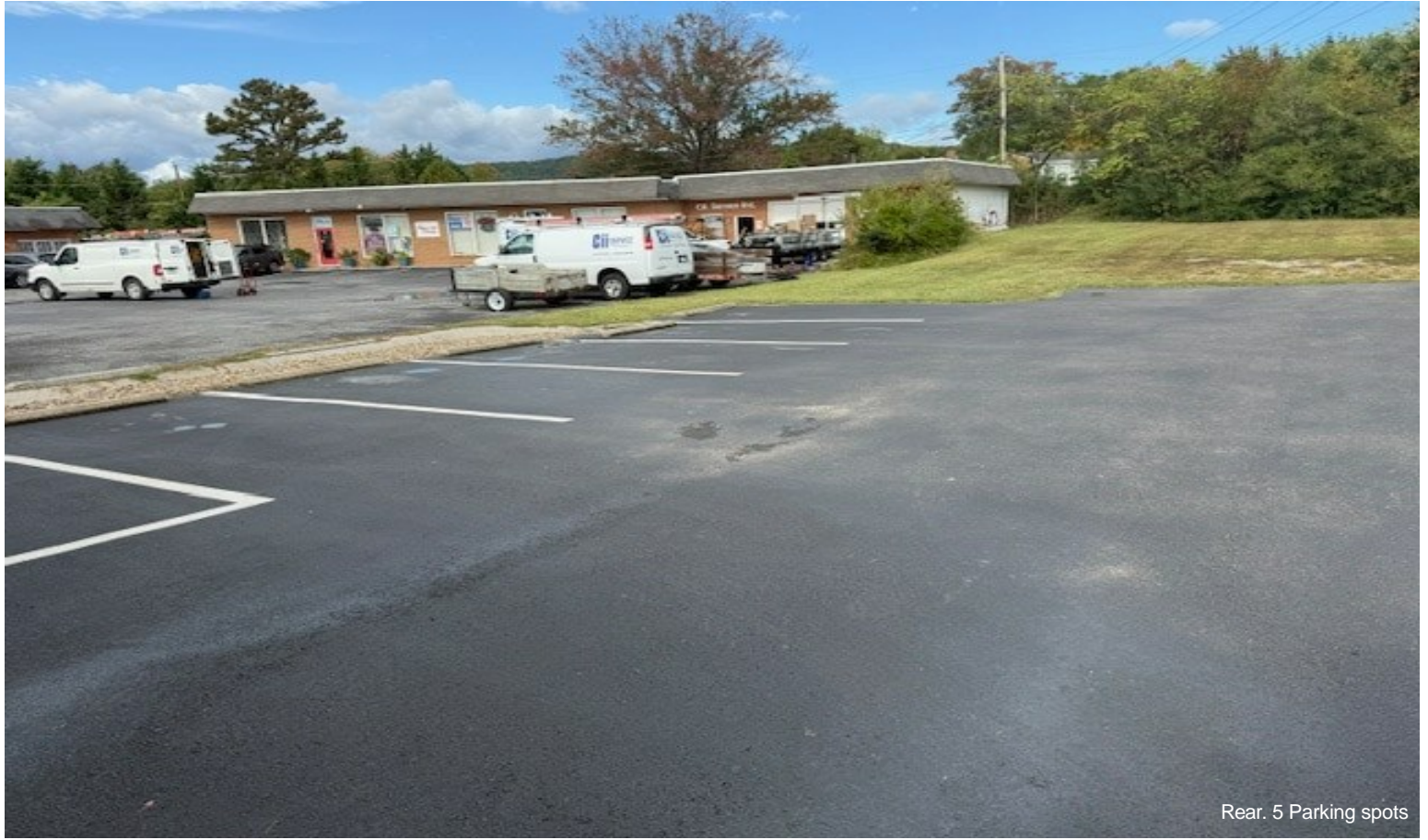
Rear. 5 Parking spots