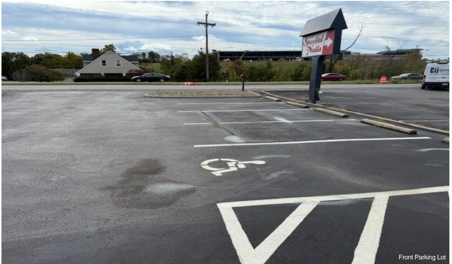
Front Parking Lot