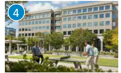
GLENLAKE LAWN OUTDOOR WORKPLACE