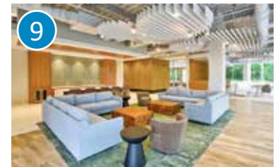
LIVING ROOM EVENT SPACE & COWORKING