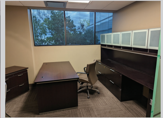
Office - 1 of 4