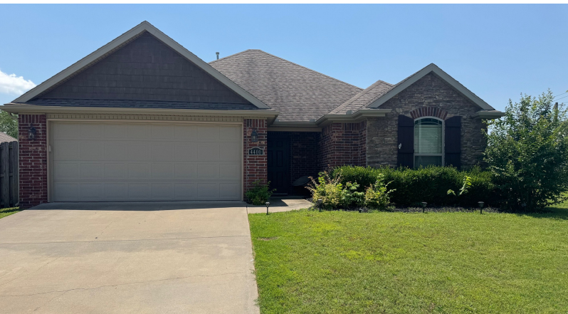
4400 Langmead Dr: 1,358