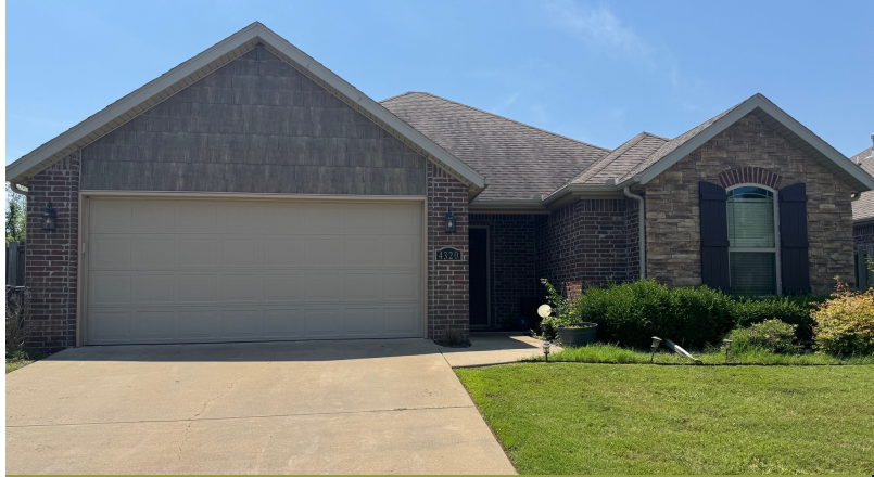
4320 Langmead Dr: 1,358