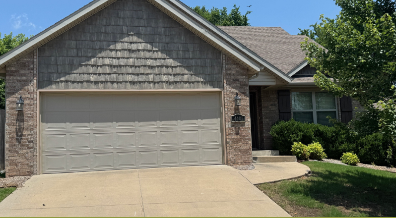
4401 Murfield DR: 1,430