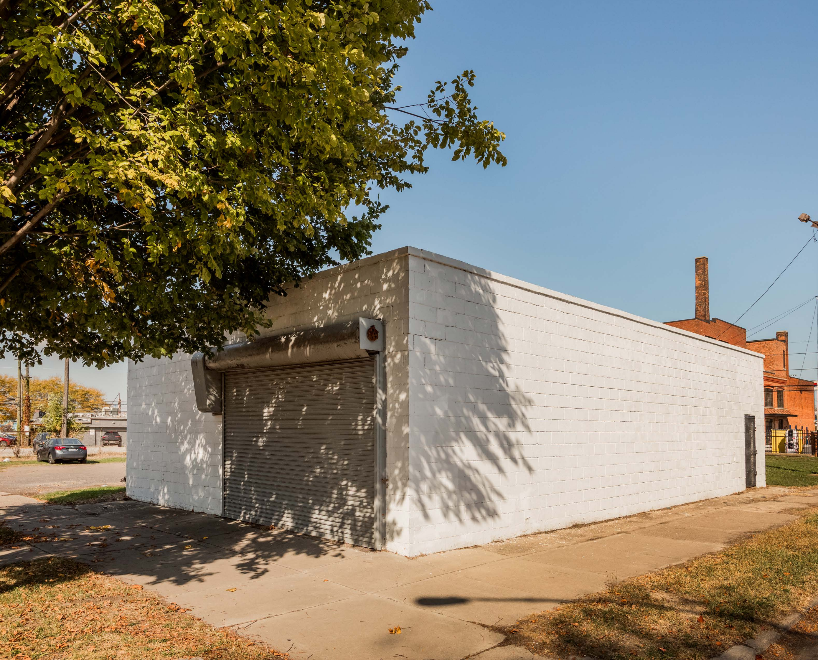
SINGLE STORY 1,500 SF BLOCK BUILDING WITH GARAGE DOOR