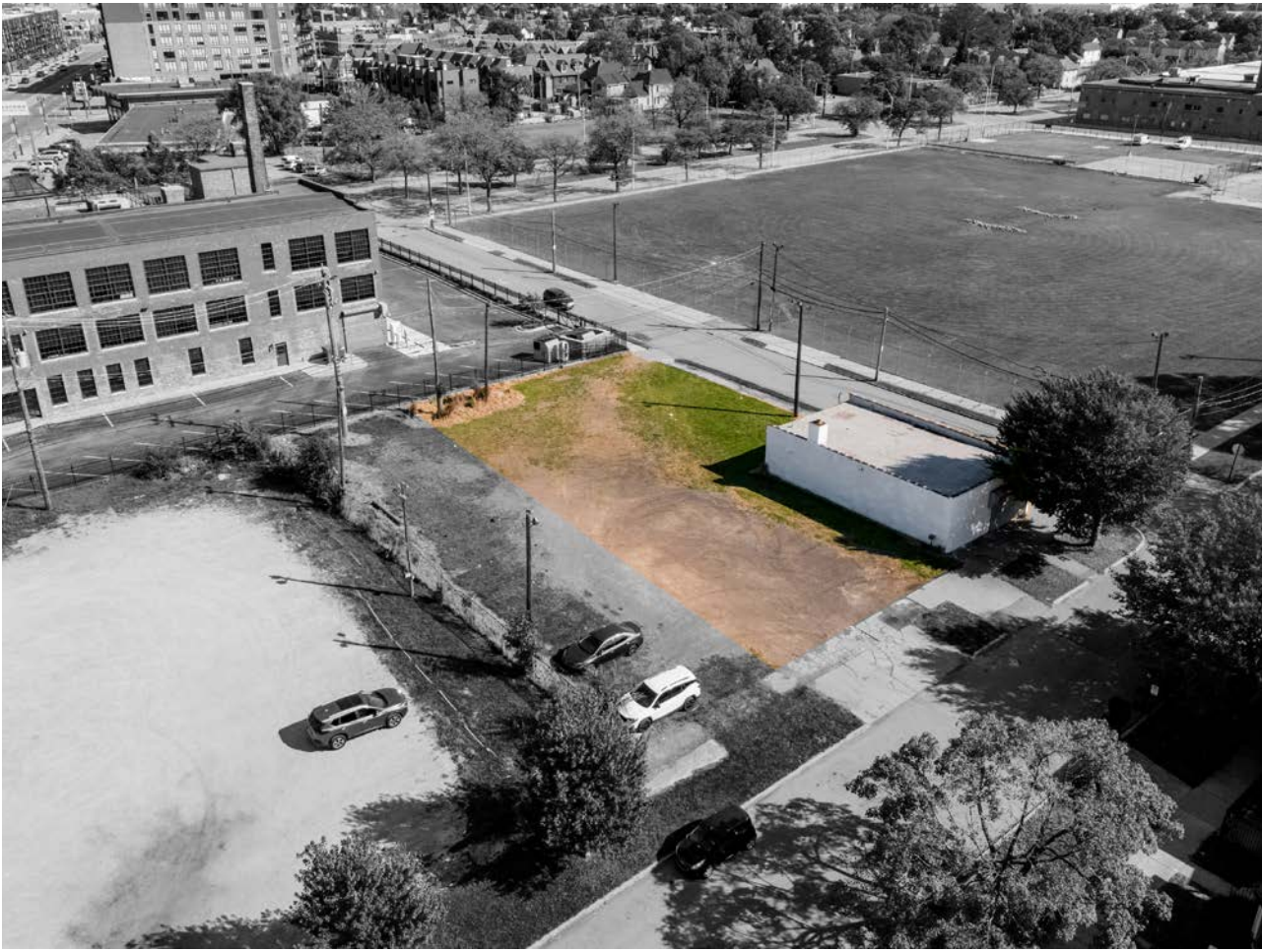
[CLOCKWISE FROM ABOVE] VIEW LOOKING SOUTH TOWARDS DETROIT RIVER, VIEW LOOKING NORTH, PARCEL OUTLINE