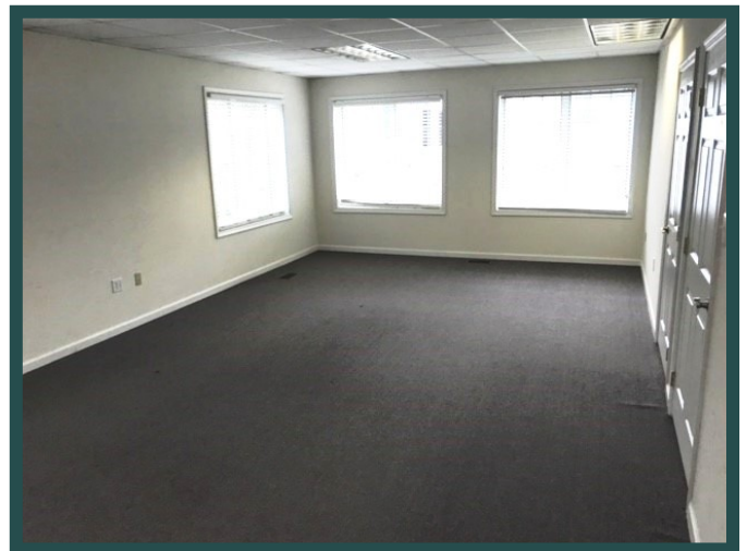
2nd Floor Office