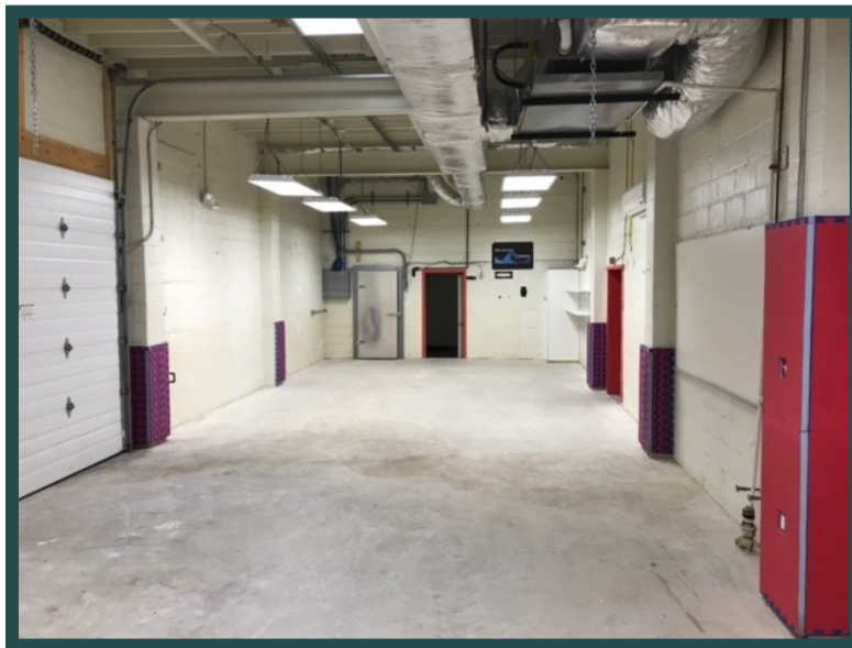
Warehouse with Drive-in Door