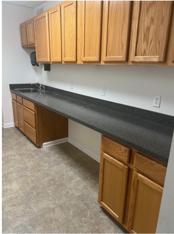
Second Floor Kitchen