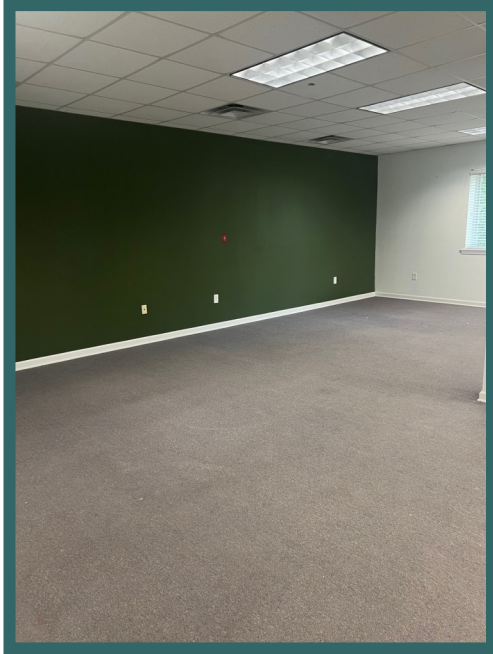
1st Floor Conference/Meeting Rm