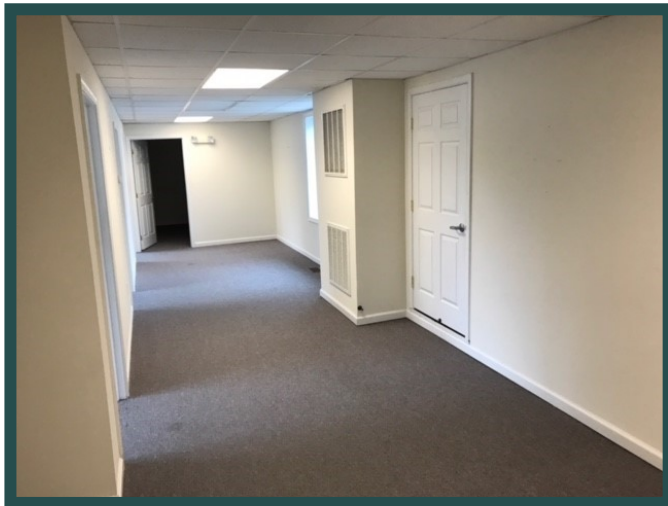
2nd Floor Lobby