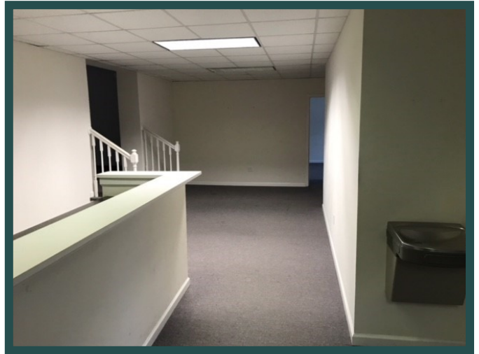
2nd Floor Hallway