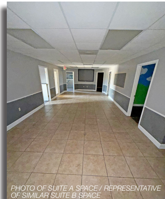
PHOTO OF SUITE A SPACE / REPRESENTATIVE OF SIMILAR SUITE B SPACE