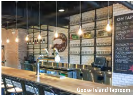
Goose Island Taproom