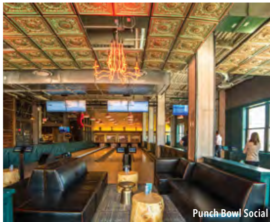
Punch Bowl Social