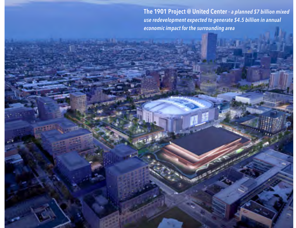
The 1901 Project @ United Center - a planned $7 billion mixed use redevelopment expected to generate $4.5 billion in annual economic impact for the surrounding area