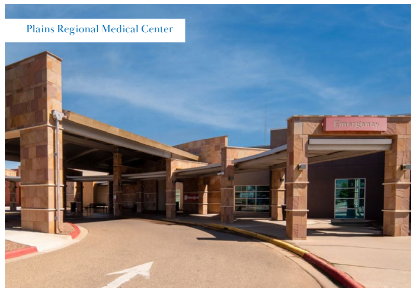
Plains Regional Medical Center