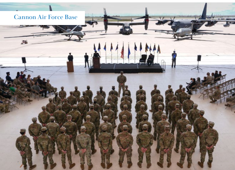
Cannon Air Force Base