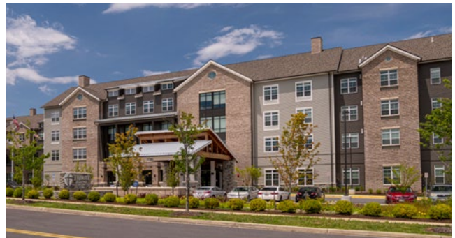
Tribute at Melford Town Center

For more information on the residential component at Melford Town Center, visit: MelfordTownCenter.com