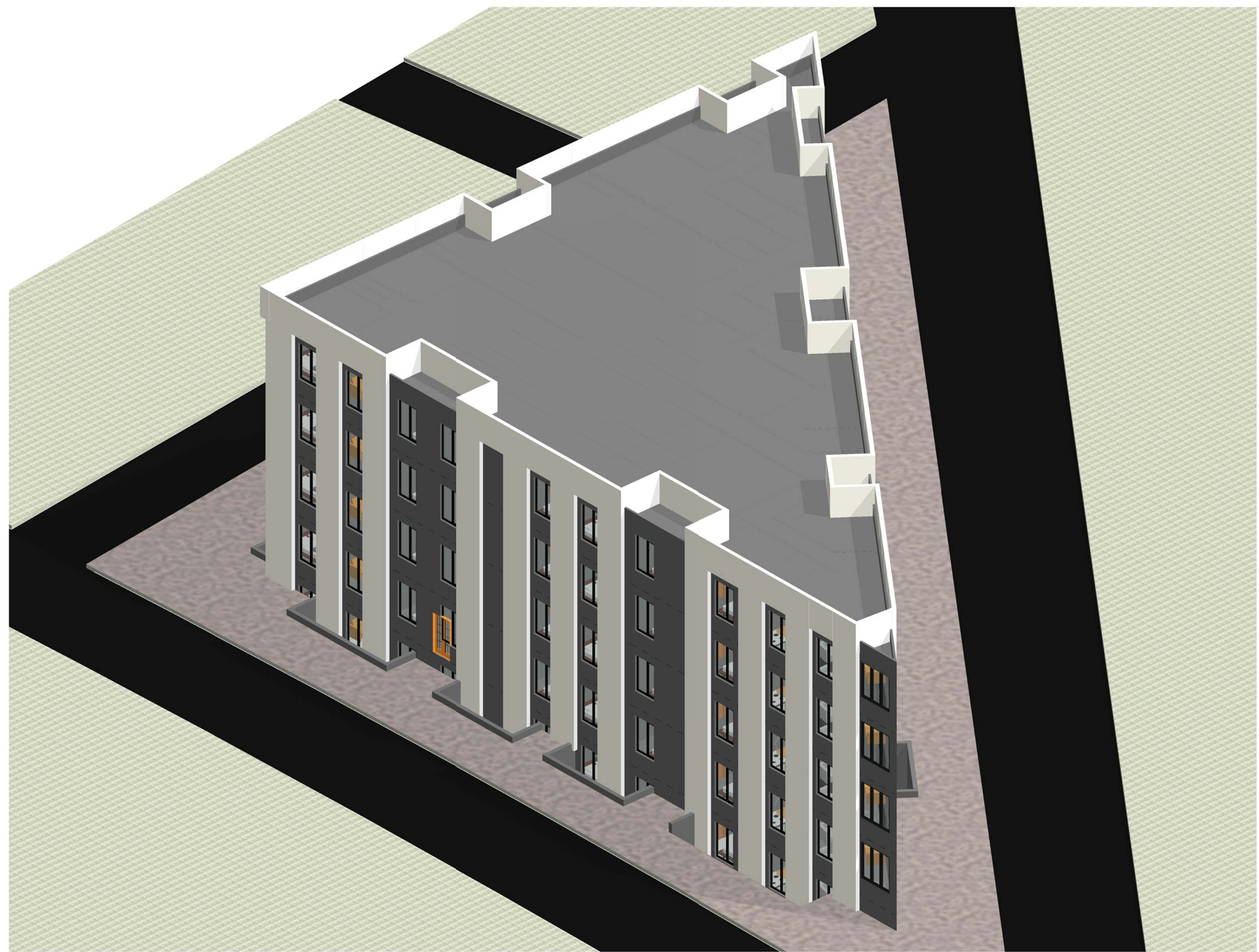
2 SOUTH WEST AXONOMETRIC