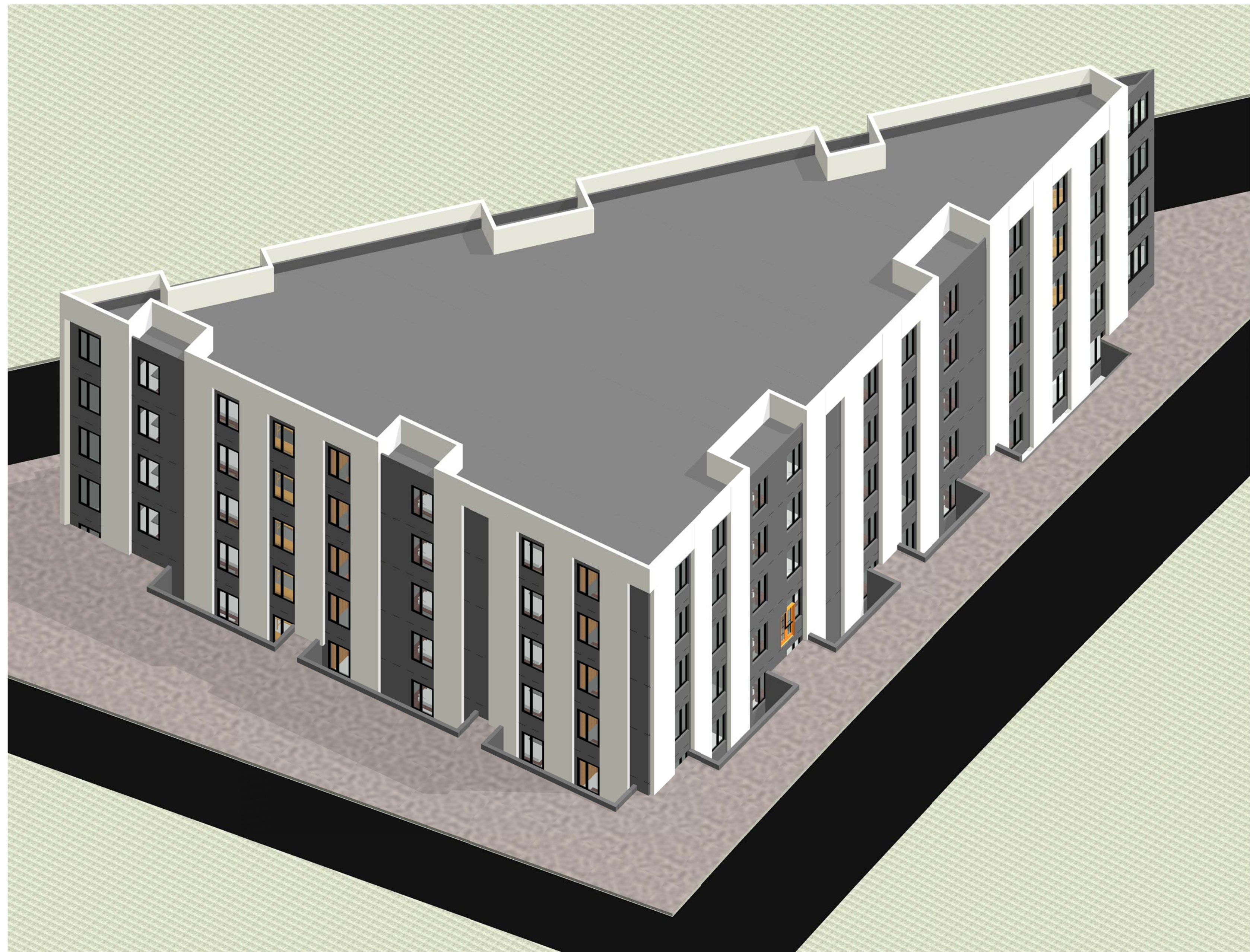
4 NORTH WEST AXONOMETRIC