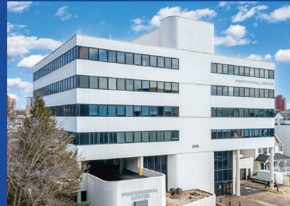
The Professional Center 999 Summer St., Stamford

Summer Street Properties, LLC PO Box 4758 Stamford, CT 06907