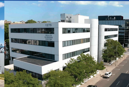
The Health Sciences Center 1275 Summer St., Stamford