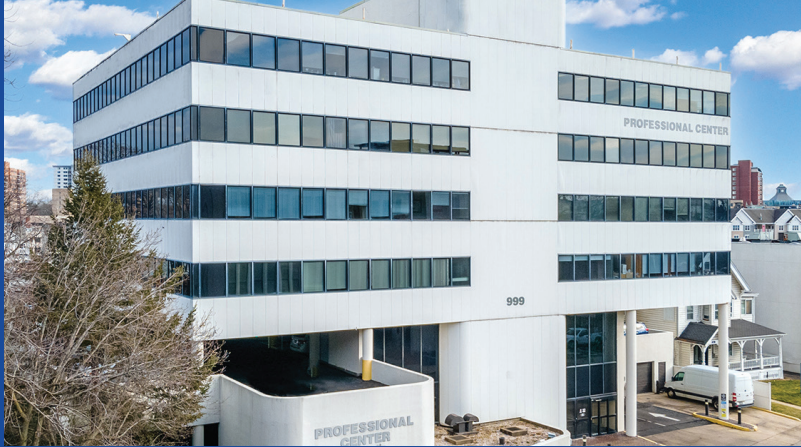
THE PROFESSIONAL CENTER 999 Summer Street, Stamford

Additional 2.5% Broker Bonus Commission Is For You Now!