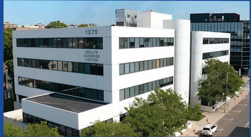
THE HEALTH SCIENCES CENTER 1275 Summer Street, Stamford