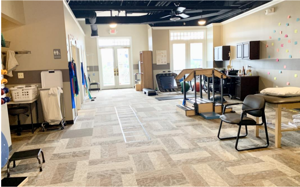
201 open area with 12ft. ceilings