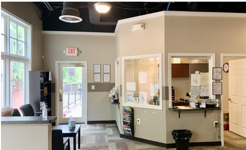
201 waiting room/reception