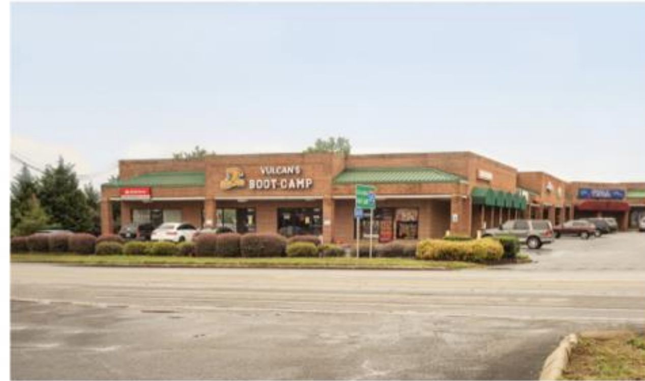
Woodruff Gallery Shopping Center

LEASING INFORMATION MARTY NAVARRO, CCIM 864-242-9211 ext.1 marty@nrepg.com