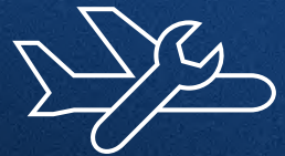
Maintenance, Repair & Overhaul