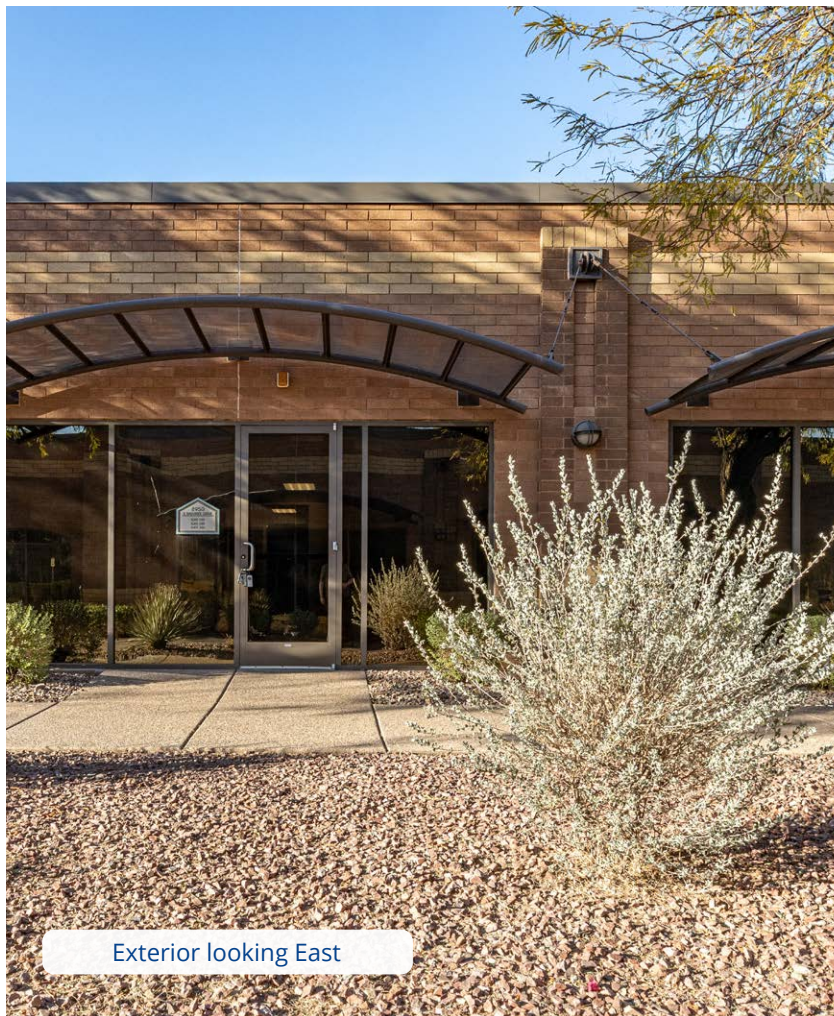
Exterior looking East