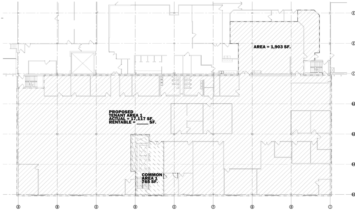
OFFICE - SECOND FLOOR PLAN 1 SCALE: 1/8" = 1'-0"