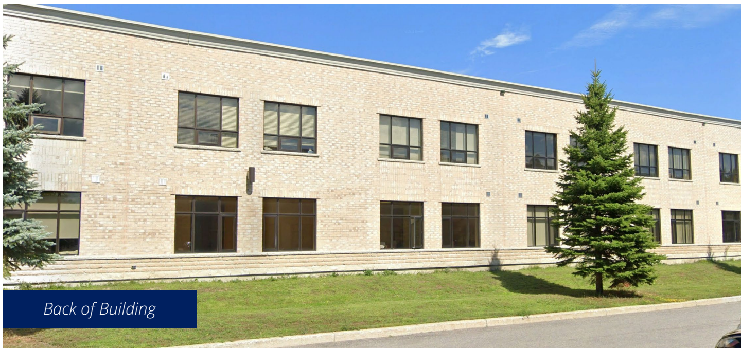
Back of Building