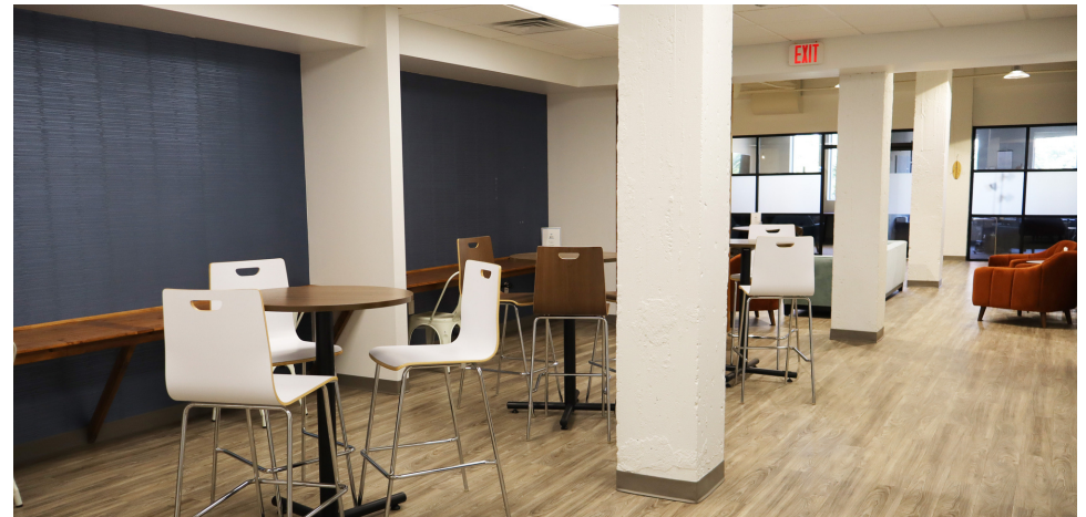
Open Work Space