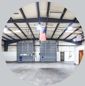
WAREHOUSE WITH TWO 14' DRIVE-INS