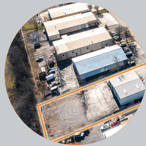
LARGE SECURED STORAGE YARD