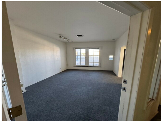
3953B-Conference Room off Balcony

3951-3957 Goldfinch St, San Diego, CA 92103