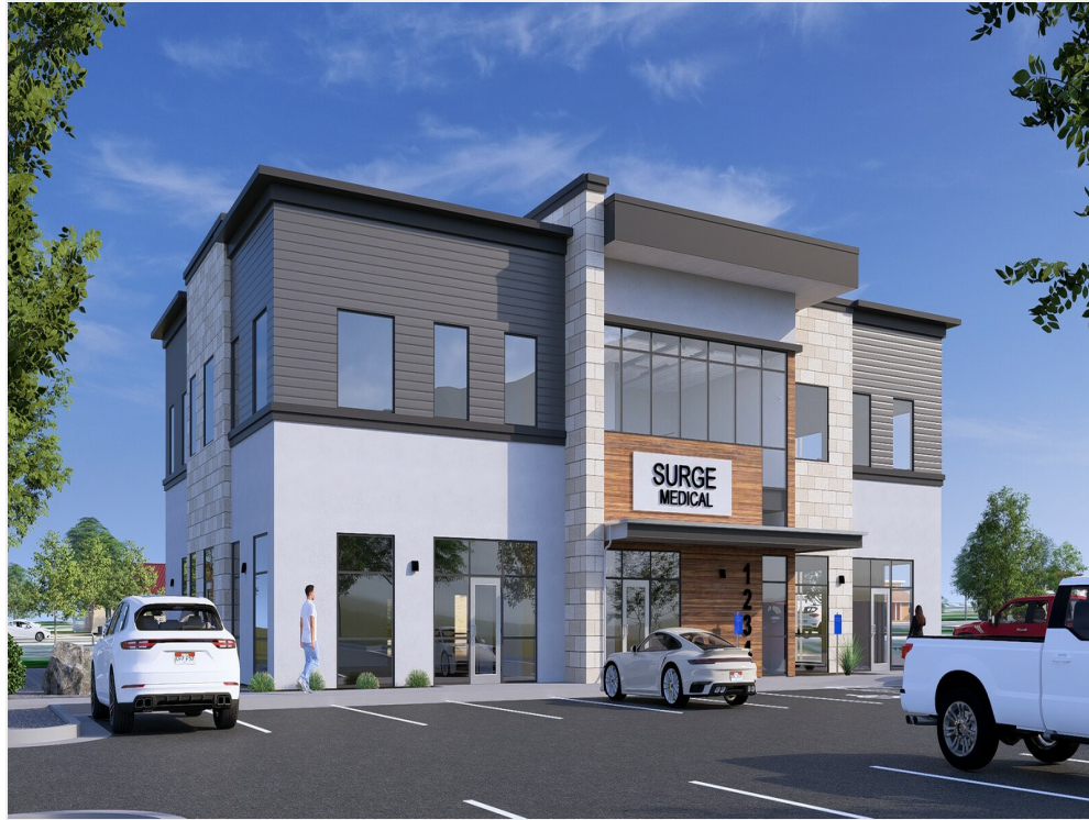
American Fork Medical Office - Exterior Render_1 - Photo