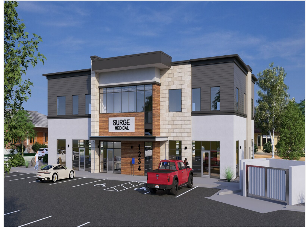
American Fork Medical Office - Exterior Render_2 - Photo