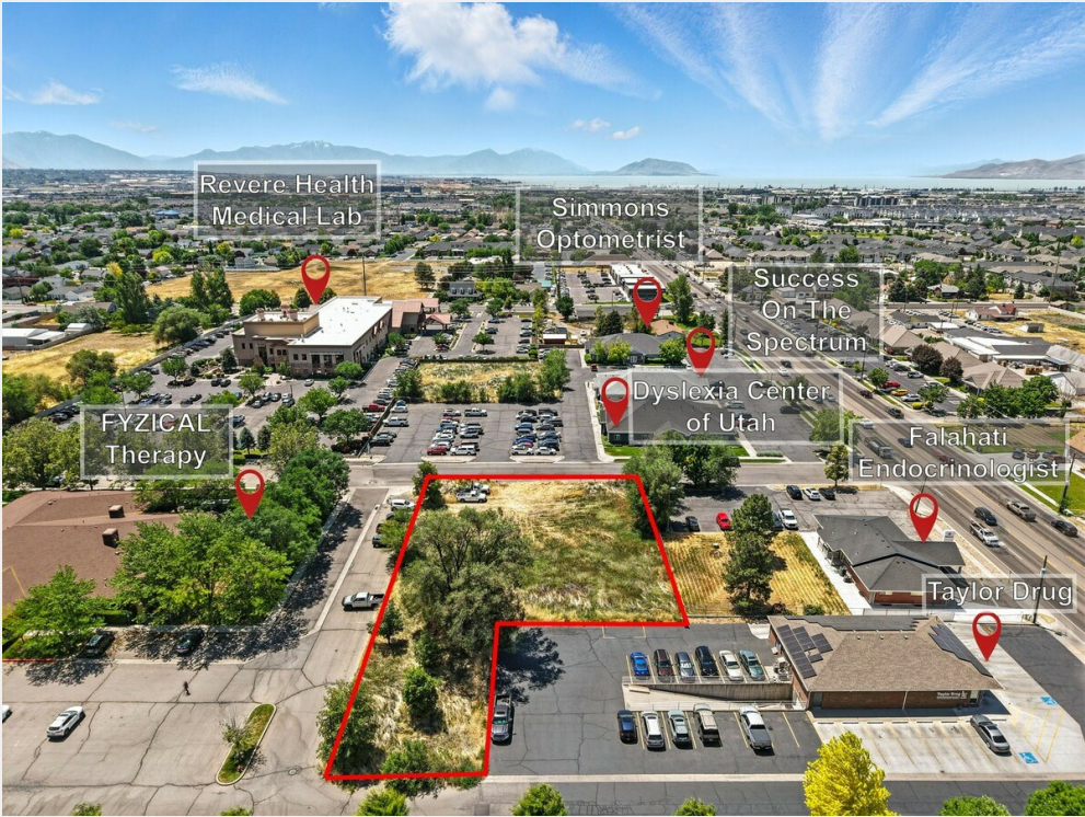
Labeled 2 (Copy)