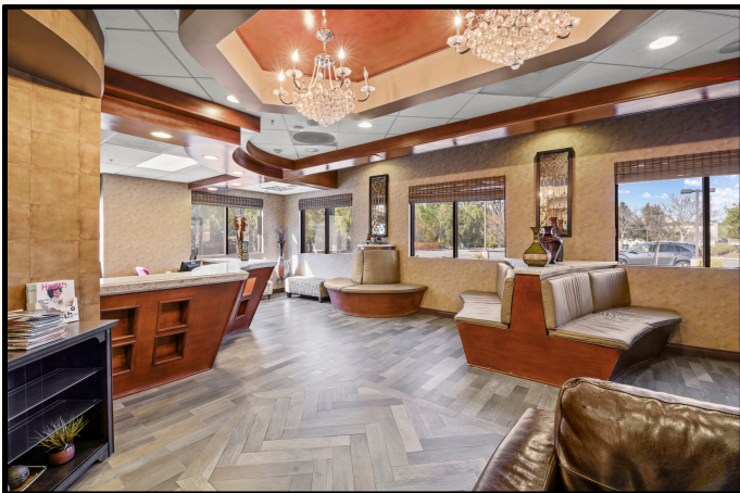
Check-in & Waiting Room