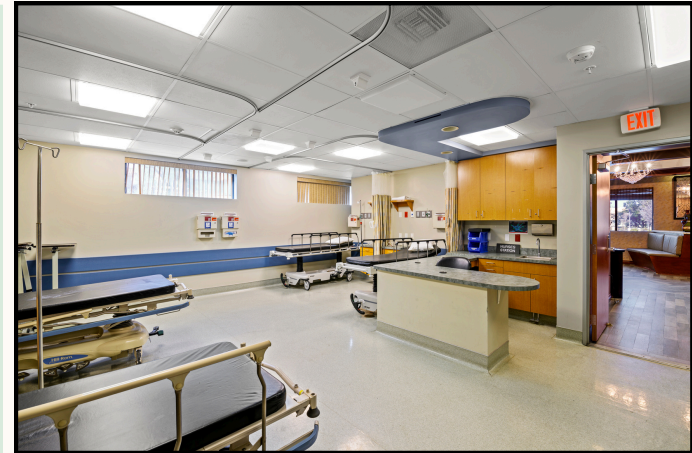
Pre Op (5 Beds)