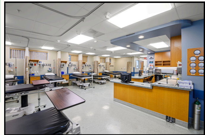
Recovery Room (9 Beds)