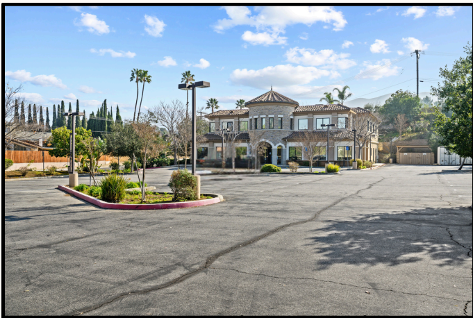
Parking Lot (64 Spaces)