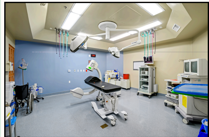
Operating Room (4 ORs)