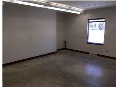
Additional open area