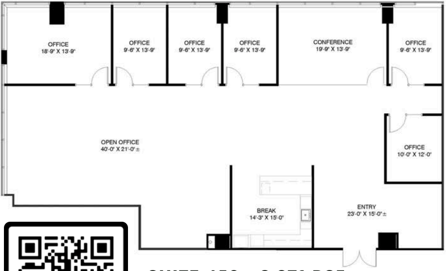
SUITE 450 - 3,871 RSF