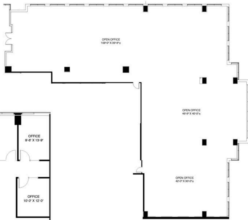
SUITE 150 - 8,692 RSF