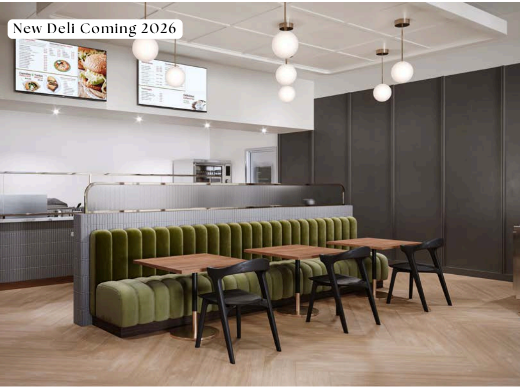
New Deli Coming 2026