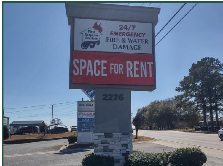
Exterior - Monument Sign