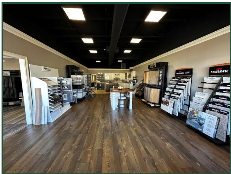
Suite B Interior - From Front