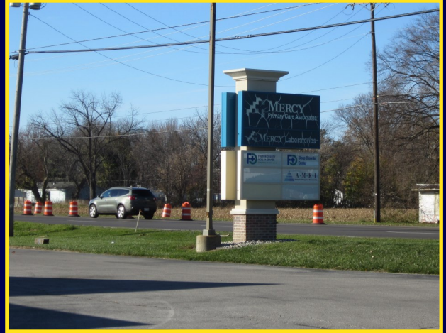
SIGNAGE ON AIRPORT HIGHWAY