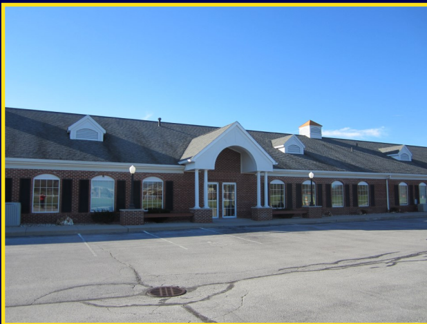
SUITE C, D - AVAILABLE