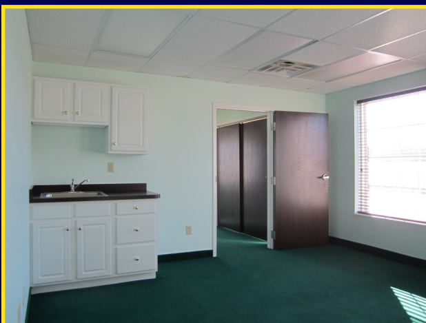
SUITE A - KITCHENETTE