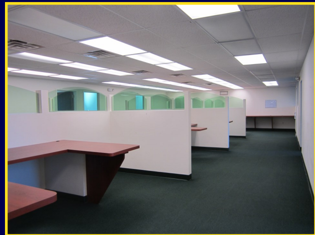
SUITE C & D - 8 BUILT IN CUBICLES