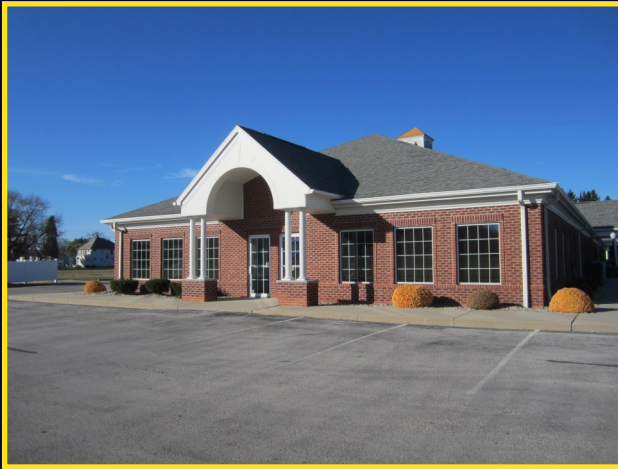
SUITE B AVAILABLE