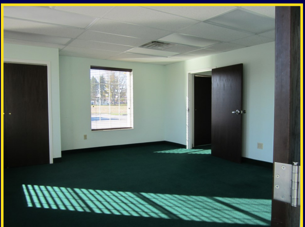
SUITE A - OFFICE