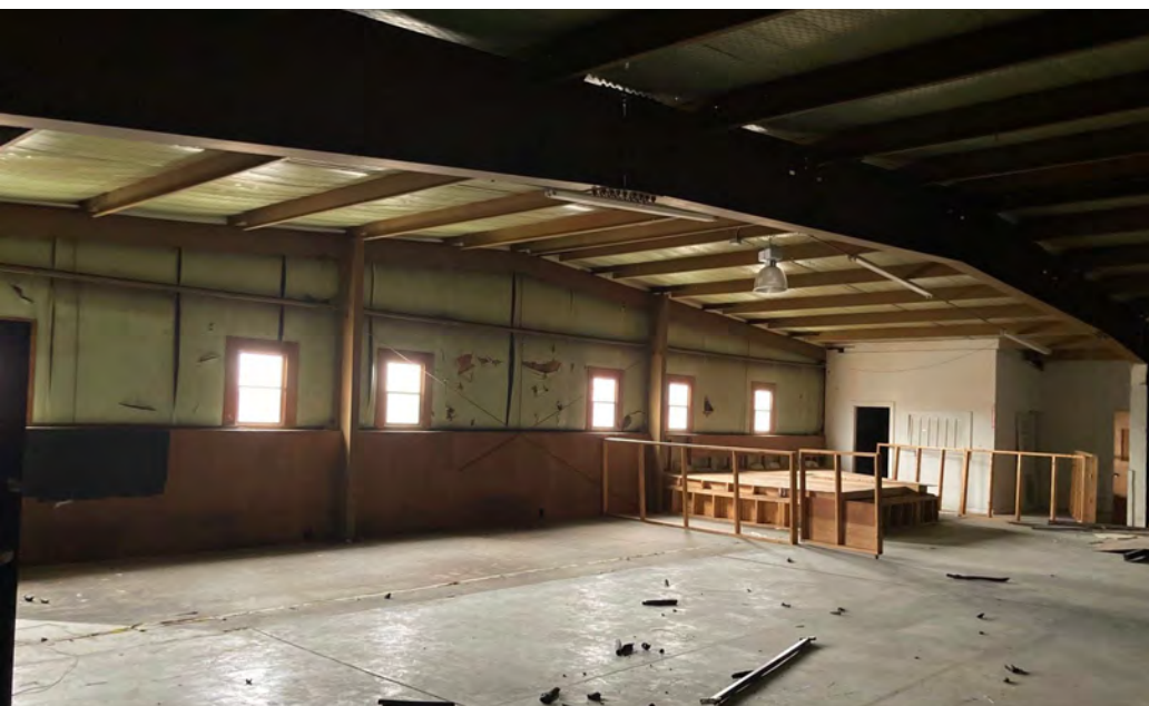
2nd Floor Interior