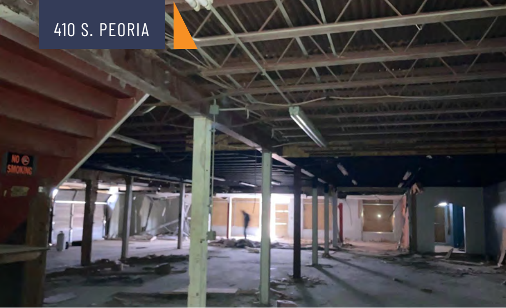
1st Floor Interior